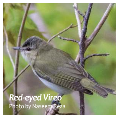
Red-eyed Vireo