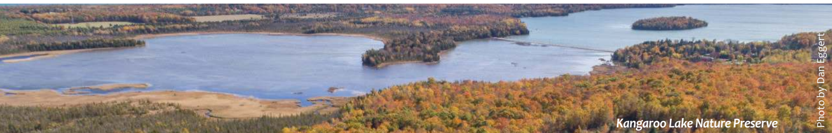
Kangaroo Lake Nature Preserve