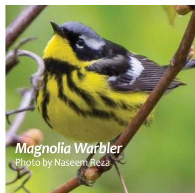
Magnolia Warbler